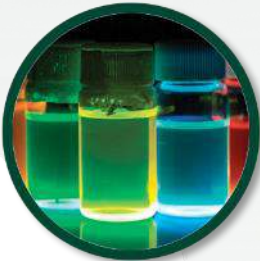
Metals & Compounds