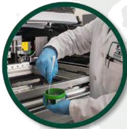
Electronics Assembly Materials