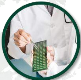
Semiconductor & Advanced Assembly Materials