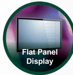
Flat Panel Display