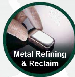
Metal Refining & Reclaim