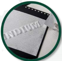
Thermal Interface Materials