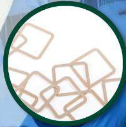
High-Temp Solder Materials