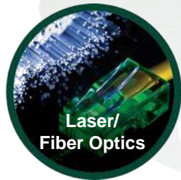
Laser/ Fiber Optics