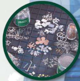
Engineered Solder Materials